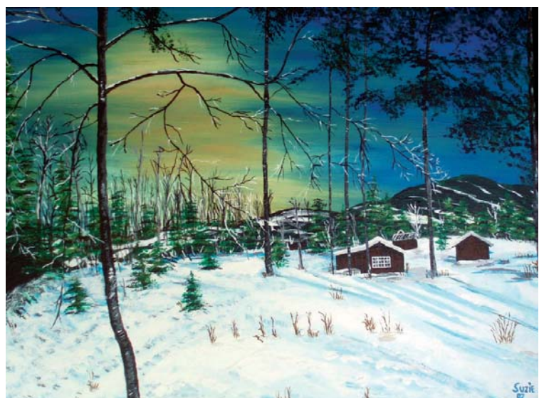
"Father's Day" 18" X 24", acrylic on canvas, 2007