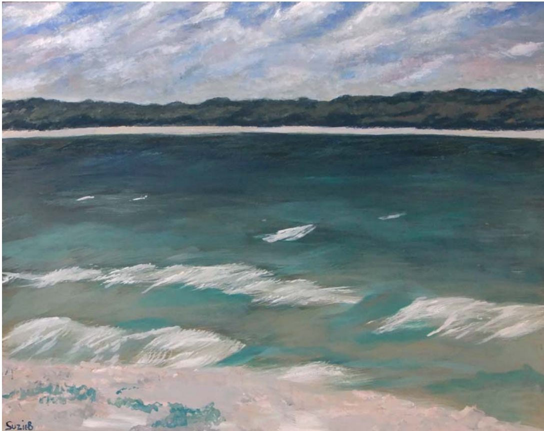
"Georgian Bay" 16" X 20", acrylic on board, 2011