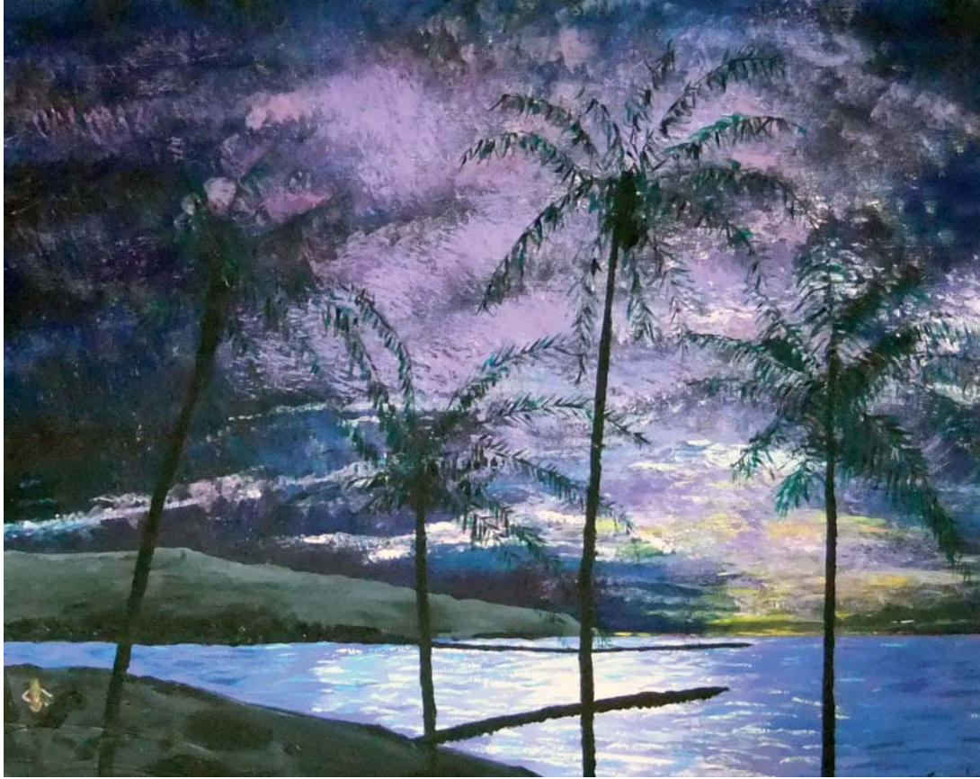
"Hawai" 16" X 20", acrylic on canvas, 2009