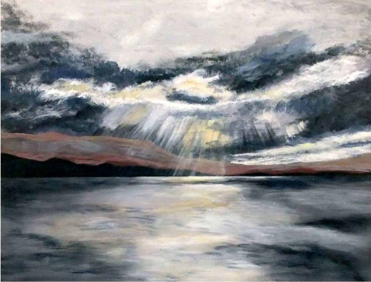
"Soleil" 14" X 18", acrylic on wooden panel, 2012