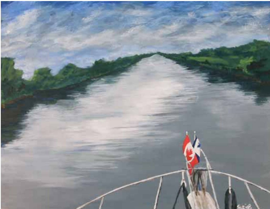
"The Trent" 14" X 18", Acrylic on board, 2011