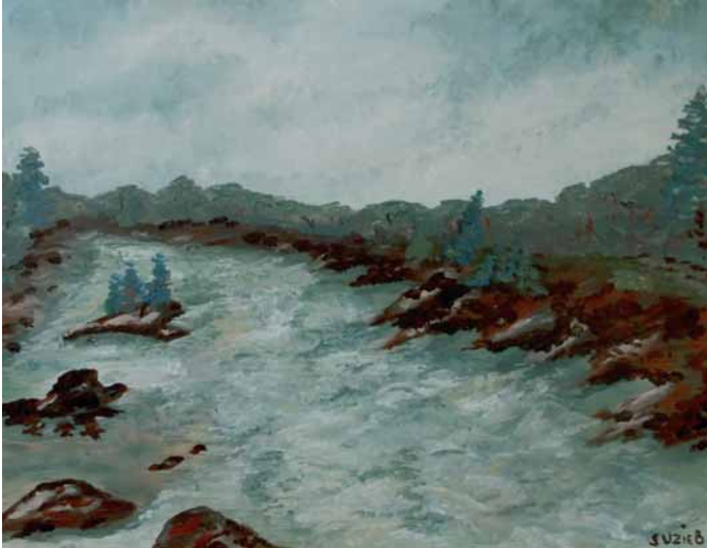
"Plaisance" 14" X 18", Acrylic on board, 2010