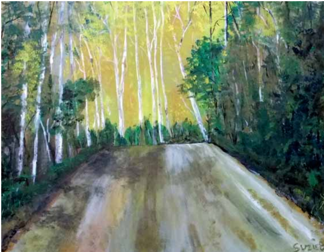
"Le Chemin" 14" X 18", Acrylic on board, 2011